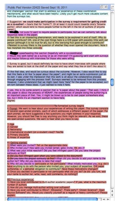
Figure 2 : The EtherPad editor as it appeared to the collaborators during our writing process. A higher resolution image is available at: http://postimage.org/image/ym6n0